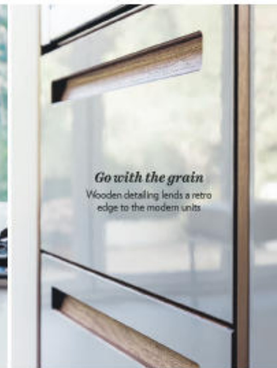
Go with the grain Wooden detailing lends a retro edge to the modern units