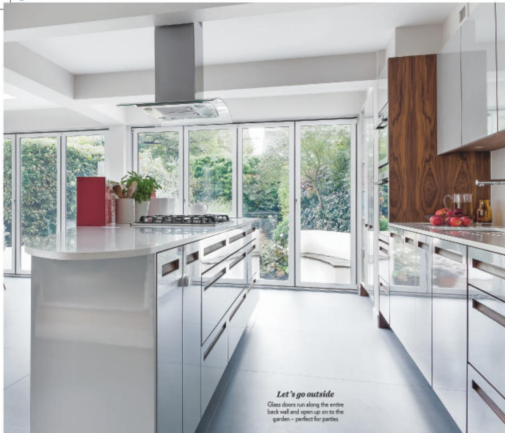
Let's go outside Glass doors run along the entire back wall and open up on to the garden – perfect for parties