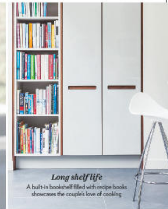
Long shelf life A built-in bookshelf filled with recipe books showcases the couple's love of cooking