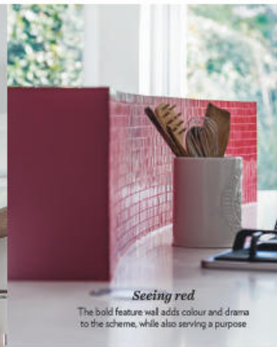
Seeing red The bold feature wall adds colour and drama to the scheme, while also serving a purpose